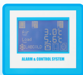
Hygienic touch screen controller

Ideal for A&E, Maternity, Community Hospitals, and Hospices etc, fitted with a Dual Compressor to ensure greater temperature control and peace of mind in the event of failure of one of the systems. Each complete refrigeration system provides 100% performance, sufficient to cool down and maintain temperatures correctly without help from the second compressor.